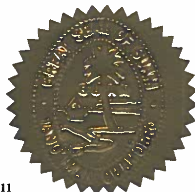
JOSHUA F. TENORIO Sigundo Maga'låhen Guåhan Lieutenant Governor of Guam